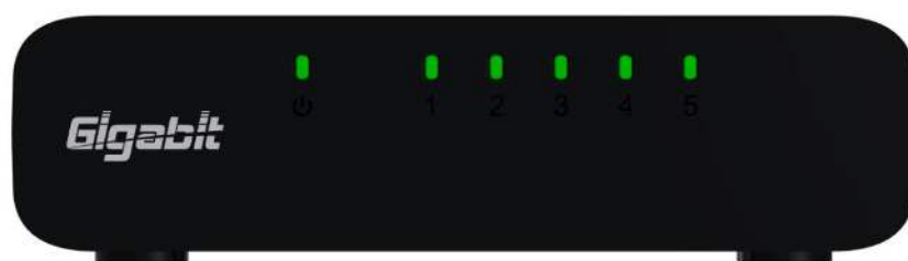
5-Port Gigabit Desktop Switch

Please refer to the following description for the front panel: