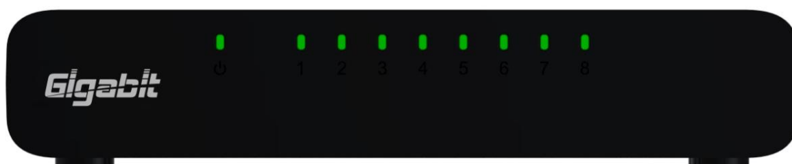
8-Port Gigabit Desktop Switch